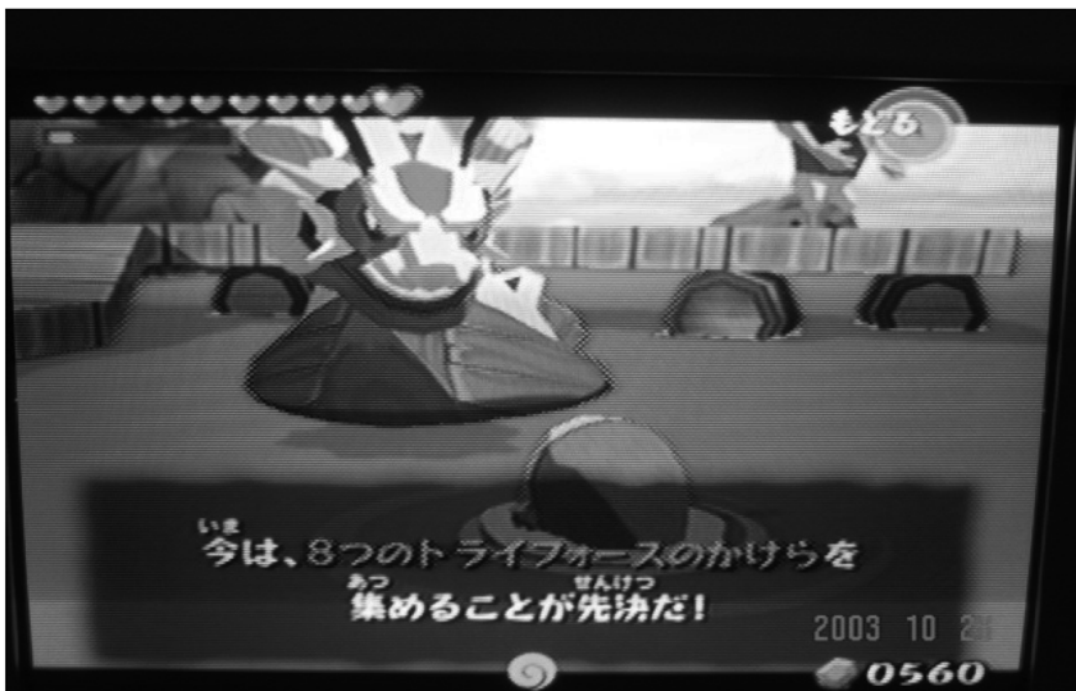
FIG. 4. Japanese game dialogues.