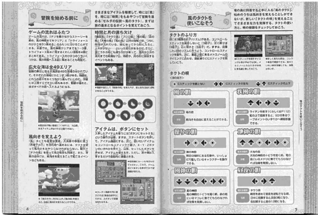
FIG. 3. Official Japanese walkthrough for The Legend of Zelda.