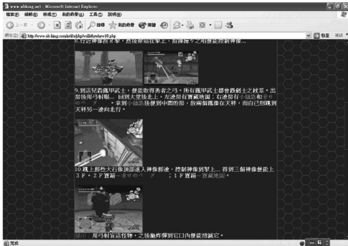
FIG. 1. Walkthroughs: step-by-step solutions.